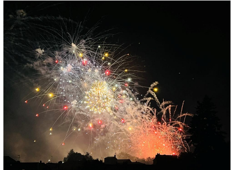
Figure B: Fireworks of the Fête de la Musique