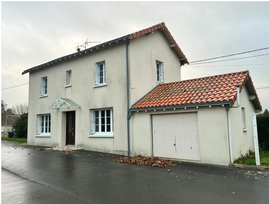
A: The Caretaker's House at #27

For more information contact us on 06 48 32 46 46 or by email at cdk@euclid.int